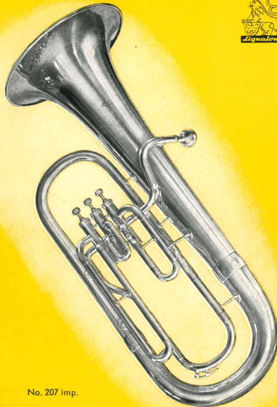
No. 207 imp.