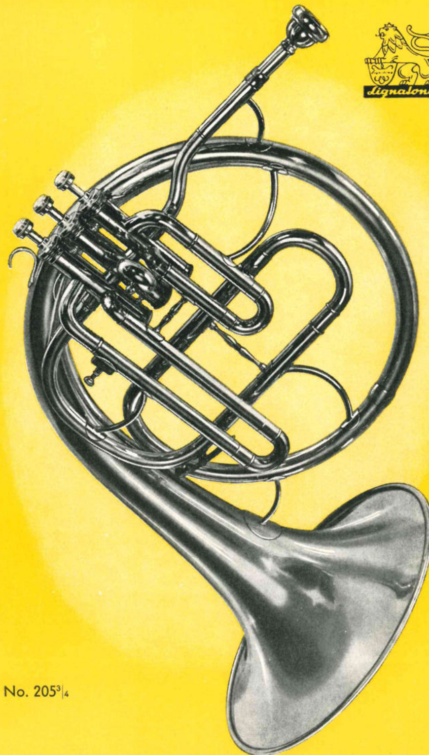
No. 205 3 / 4