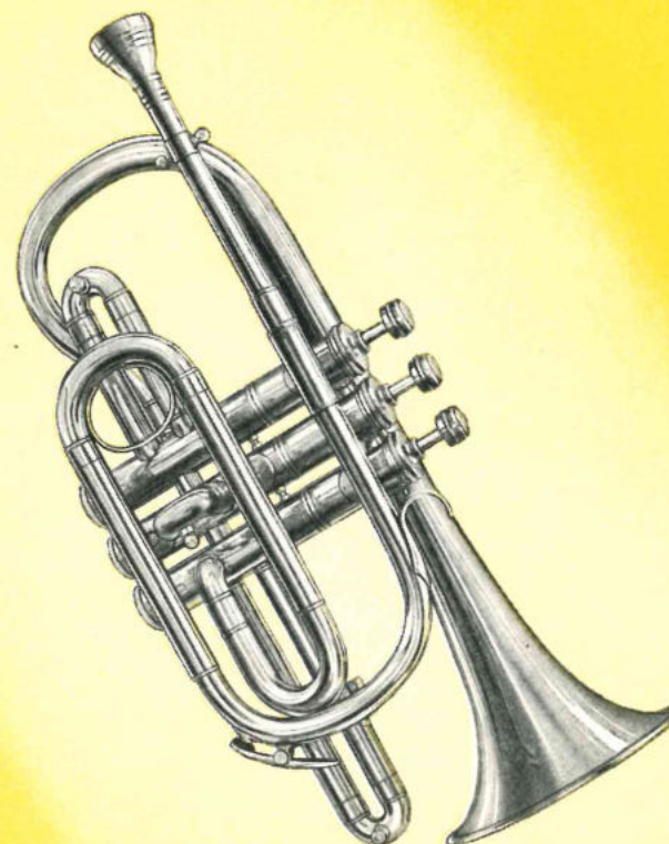
No. 200 B